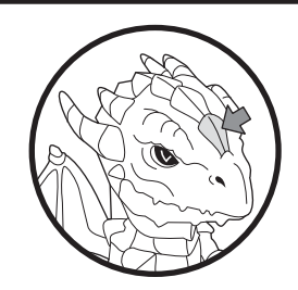
Tap its nose: Once, twice or three times for surprise sounds and reactions!