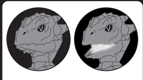
I light up when I'm untamed!