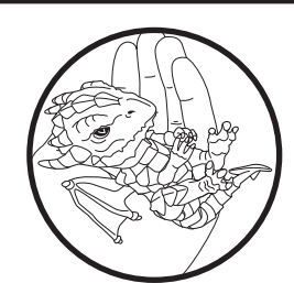
Cradle your Untamed Fingerlings®: Time for a nap!