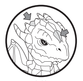
Press & hold sensors on the nose and the back of the head for a funny surprise!