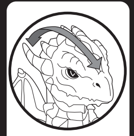
Pet your Untamed Fingerlings® (once or many times!)